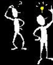
Table Topic Master - Carolyn Lott